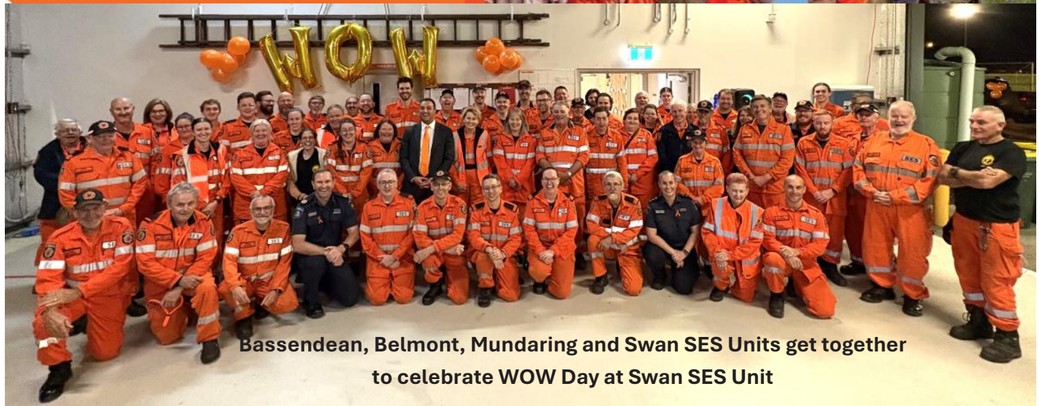
Bassendean, Belmont, Mundaring and Swan SES Units get together to celebrate WOW Day at Swan SES Unit