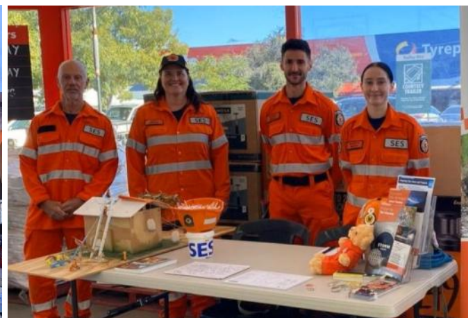
Mount Barker SES Unit and Melville SES Unit celebrate Wear Orange Wednesday