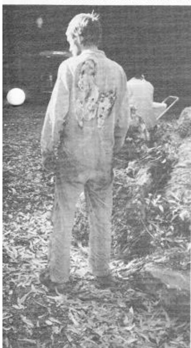
WESTERN ALERT, SUMMER, 1987

Five campers, three adults and two children decide that one of the caves is a good place to set up camp for the night. They sleep well and wake up feeling hungry, time to cook breakfast. Disaster, the gas bottle blows up. The injuries sustained are pretty horrific (thanks to Jan and Jeff Smiths' excellent make-up).