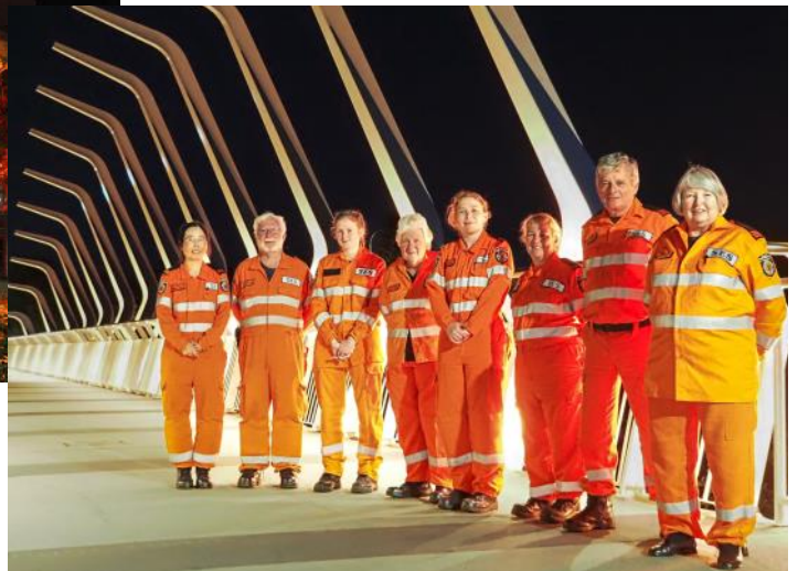
Right: Bunbury SES Unit Members on the Koombana Footbridge