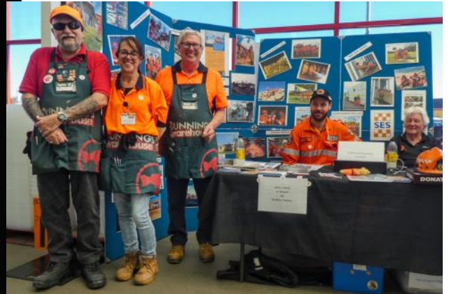
Above: Bunnings WOW Day — Community Engagement Stand. Bunnings donated a fire basket, fire wood and lighters for Bunbury SES Unit to raffle off to raise funds.