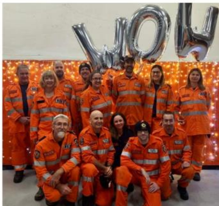
Happy WOW Day