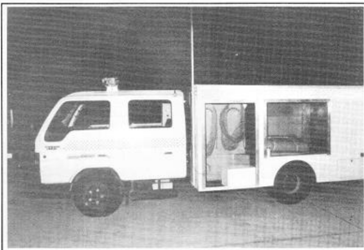
Crew cab and side compartments

Along came the Lottery Commission grants and this was too good an opportunity to pass up so our planning went into top gear.