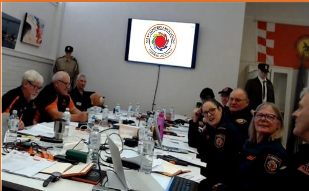
Regional Representatives pictured at the 8th June 2024 Face to Face Management Committee Meeting at Belmont in the SESVA Conference Room

If you have not previously held a position on a management committee, we believe you will find the experience rewarding, and maybe at times challenging.