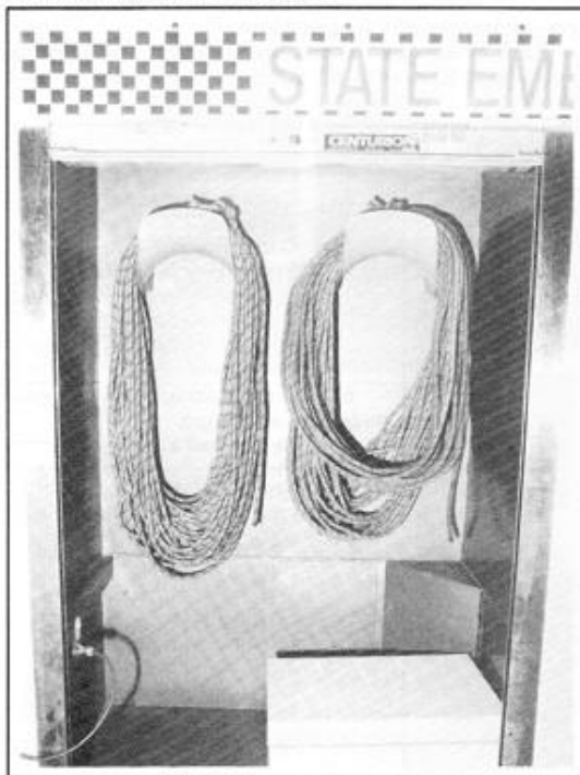
Left side large compartment

A design committee was formed with a task to confirm just what was needed and to cost the proposal and prepare a submission to the City of Wanneroo and to the Lotteries Commission.