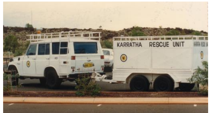
The rescue vehicle above (1971 Toyota FJ 55) and equipment trailer was stored at the Police station