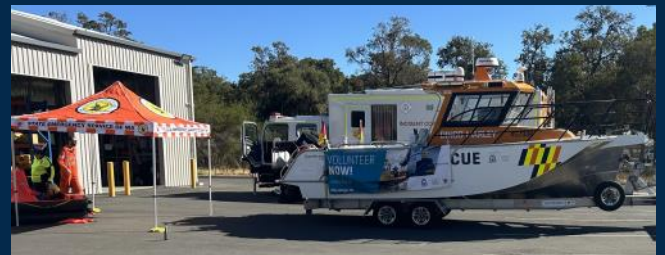
Submitted by R McConchie DLM Bunbury SES