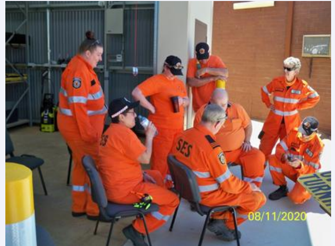
Merredin Unit members receiving training on the new equipment

At a recent training day all unit members were introduced to the new equipment. They were given theory and practical training before being let loose in the region tracking and locating targets as set out by the units Training Manager, basically navigating to a site using GPS’s only and retrieving an object (a small plastic key tag) placed there by the TM.