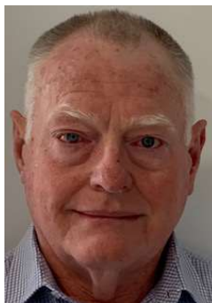
President of the Tasmania State Emergency Service Volunteers Association