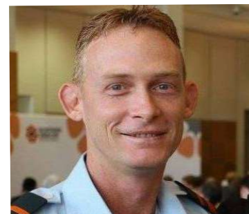
President of the NT State Emergency Service Volunteers Association