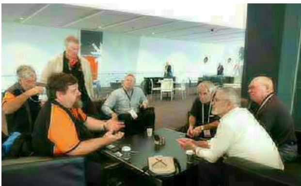
Members of the SESVAs of WA and NSW discussing a future National SESVA - Perth AFAC 2012