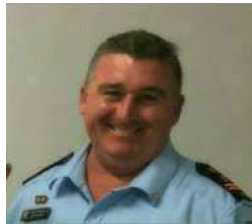
President of the Queensland State Emergency Service Volunteers Association