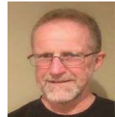
President of the Victorian State Emergency Service Volunteers Association