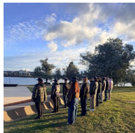
Column 1 top: Group photo with the Governor General at the Memorial.

I couldn't recommend highly enough that other young people in SES put their name forward for this experience in 2027.