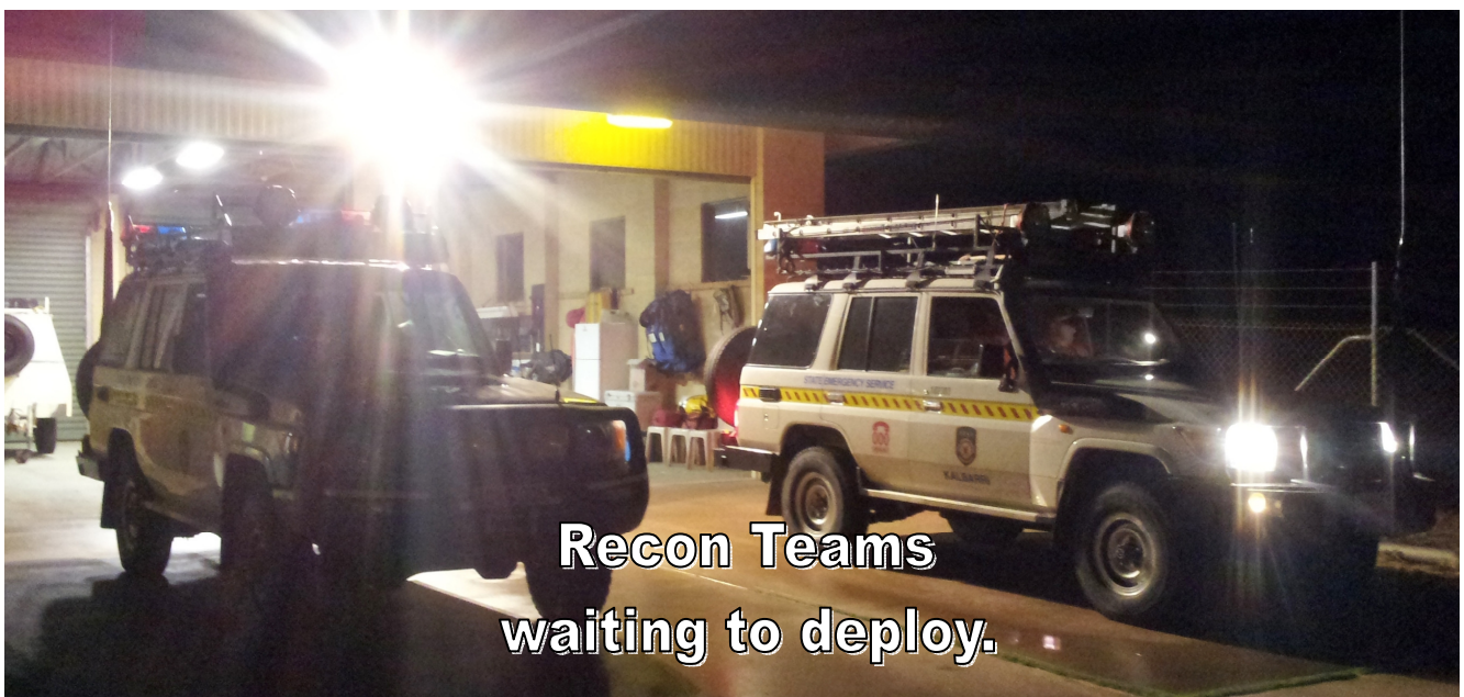
Recon Teams waiting to deploy.